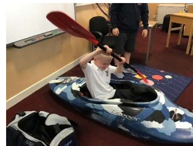
A scene from last term's P5-7 class talks